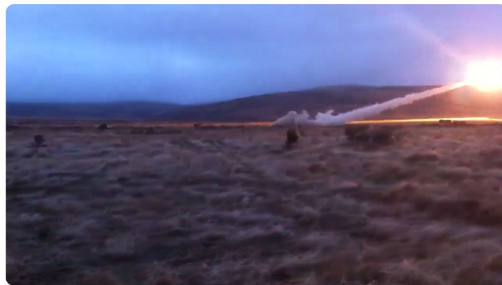
5-3 / A 1-94 HIMARS live fire at Yakima Training Center Nov

The solution: what options would you suggest to the faculty member as your institution's copyright specialist?